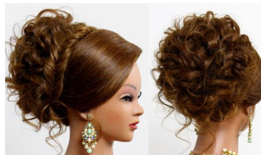
HAIR STYLES/HAIR CARE